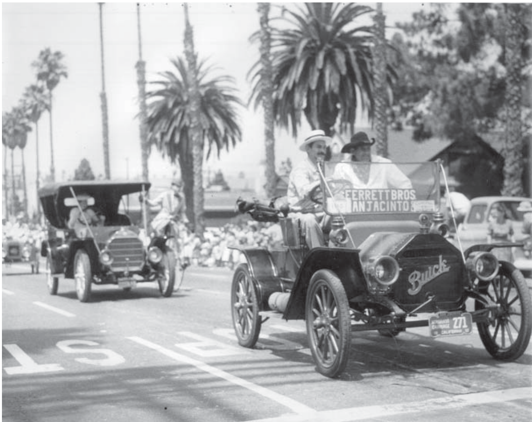
Early Buick in a parade on Mission Ave