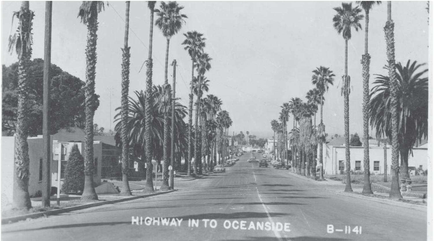
Second Street (Mission Ave) looking west from about Horne Street circa 1952.